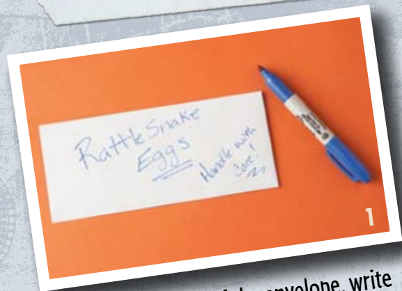
Step 1: On the outside of the envelope, write "Rattlesnake Eggs. Handle with Care."

Do you have friends who are squeamish about snakes? This prank is perfect for them. But be warned, some of your pals might wet their pants. Don't stand too close!