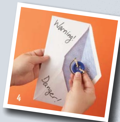
Step 4: Wind the button until the rubber band is twisted tightly. Place the button inside the envelope. Grasp the button through the envelope with your other hand to keep it wound up.